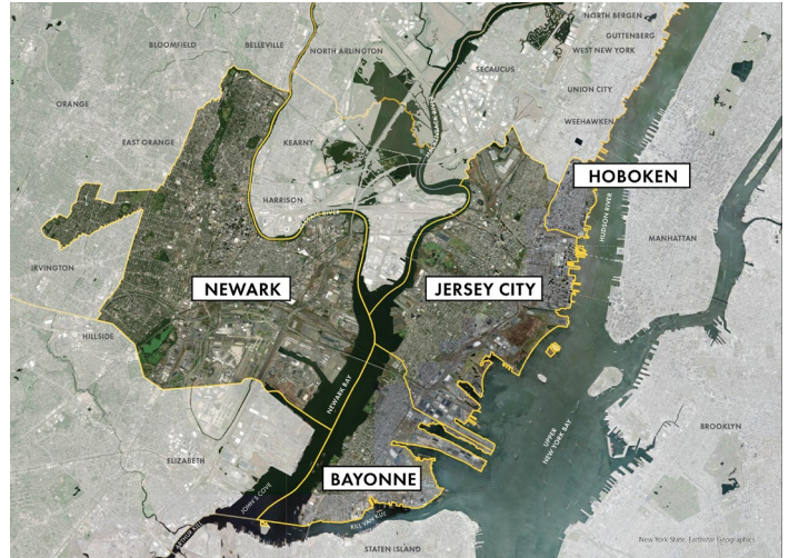
Resilient Northeastern NJ Project Area

See the second page of this flyer to GET INVOLVED!